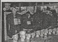
Uniforms and headgear, flags and personnel memorabilia tributes on display.