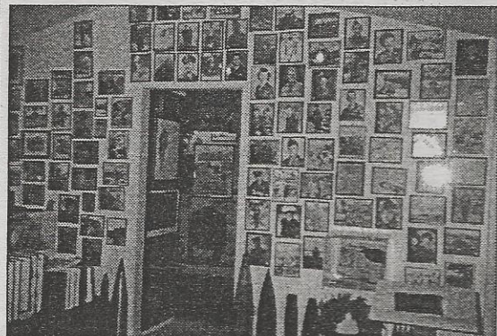
Wall of Honor, 8x10 photos signed by veterans or his family, dates of service, area of ops and war are noted on each photo. A special tribute to the Veterans Service.