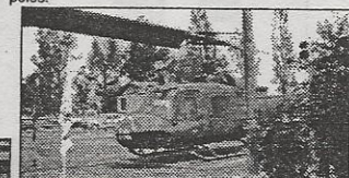
Vietnam "C" model helicopter "Easy Rider" 1/9 Air Cavalry in front of museum.

Hours: Every Thurs. Evening 7 - 10 p.m. First Sat. Each Month Veteran's Day and Memorial Day 10 a.m. - 4 p.m.