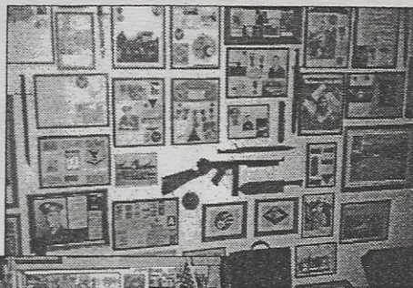
Personnel displays include veterans photos, patches, medals and memorabilia that tell their story.