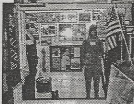
The Civil War, First World War, and American Legion, VFW and Korean War are also displayed.