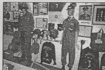
Viet-Nam flight suit and 1965 Air Commando uniform and chopper helmets in Viet-Nam display.

5865 "A" Road Marysville, CA 95901 (530) 742-3090