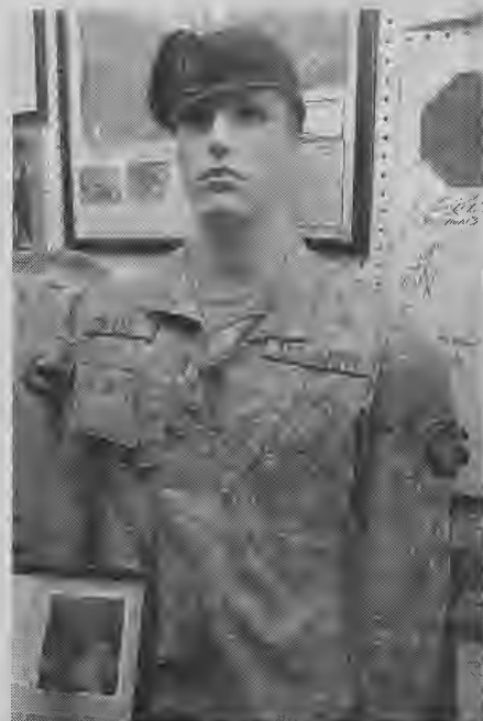
Left: Tributes to lost comrades. Middle: The dog tag memorial for those lost in Iraq and Afghanistan. Right: One of the many uniformed mannequins.