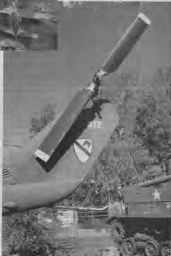
Military equipment on display outdoors at the museum.